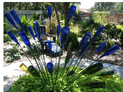
A bottle tree adds whimsy and sound to the landscape.

Photos taken in Jeanna’s former backyard garden in Spanish Woods.