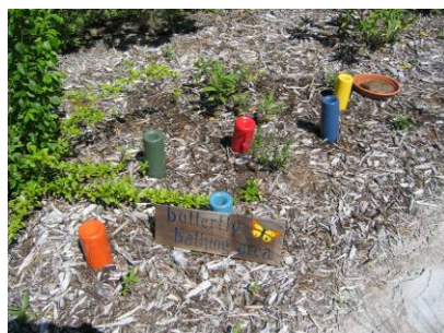
Painted glass bottles turned upside down provide water for butterflies.

The same basic principles of good landscaping apply when choosing and placing garden art and decoration. Focusing on a theme for your garden is one of the first steps toward satisfying the landscape principle of unity. For example, if you want to create a butterfly garden you could use plants known to attract these winged jewels as well as statues, ornaments, and other décor related to butterflies. If you have a large landscape and plan on having several themes or “garden rooms”, you can maintain unity across these rooms by repetition - utilizing one or two consistent elements across all the areas, such as color schemes, textures, or size.