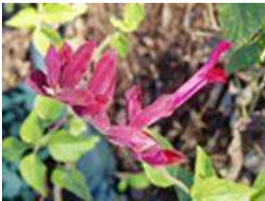
Photo December 2004 - Scarlet Sage planted earlier this year

The best is when I need that one photo for my garden journal. To preserve that one perfect boom that comes along. With a digital camera I can immediately see the image, and if it is not what I want, I just snap another.