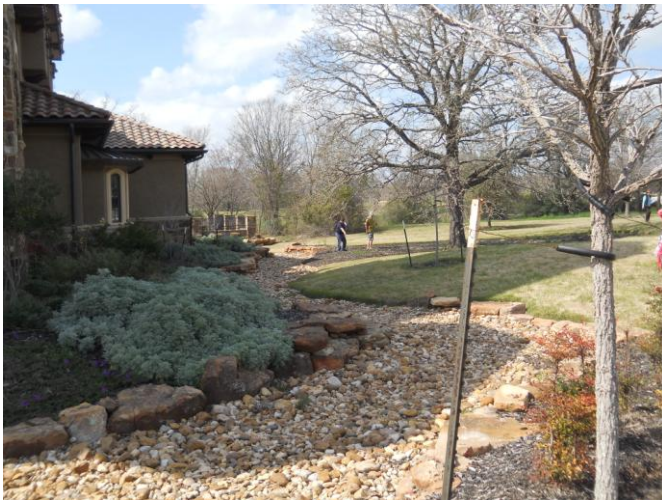
One of the homes on the tour.