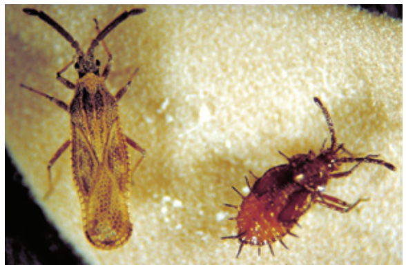
Figure 6. Lantana lace bug, Teleonemia scrupulosa , on Texas sage.