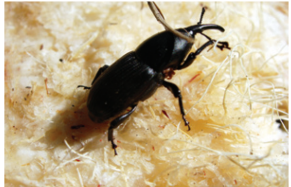
Figure 10. Adult agave, or sisal, weevil (Curculionidae; Scyphophorus acupunctatus ) on yucca.

Cactus moth caterpillars have alternating bands of orange and black. The caterpillars, or moth larvae, feed together while mining