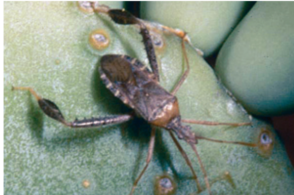
Figure 1. A leaf-footed bug (possibly Leptoglossis species) on prickly pear cactus.