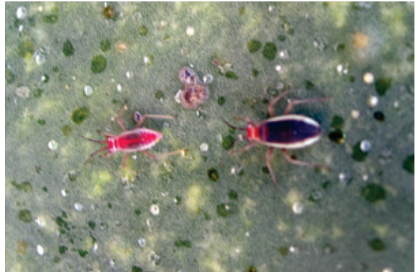
Figure 4. Hesperolabops gelastop on prickly pear cactus.

Texas sage in the landscape can be damaged by the lantana lace bug, Teleonemia scrupulosa (Tingidae; Fig. 6). Damaged leaves appear speckled with pale (chlorotic) spots. Heavily infested shrubs may be defoliated and decline in health. Adult and developing stages reside on the undersurface of leaves and leave dark specks from their waste.