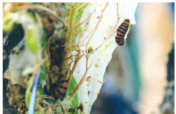
Figure 12. Cactus moth ( Cactoblastis cactorium ) on prickly pear cactus in Australia.