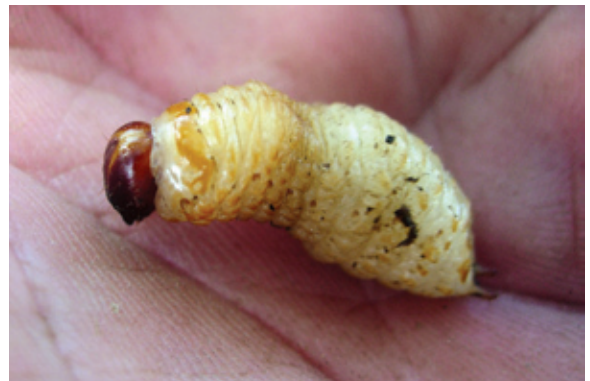
Figure 11. Larva of agave weevil.