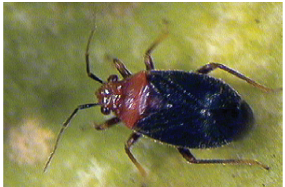
Figure 5. Halticotoma (Miridae) species on yucca.